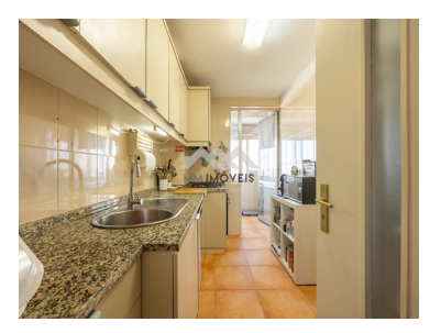
= 2 Bedrooms